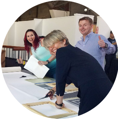
Blank canvases for kids

HandsOn Bay Area has many engaging ways to volunteer at your offices, meetings, and conferences.