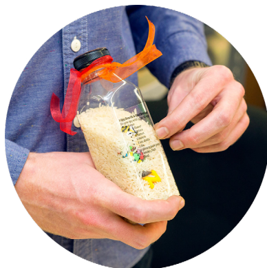
Sensory kits for children with disabilities