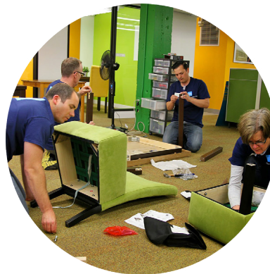
Nonprofit facilities improvements