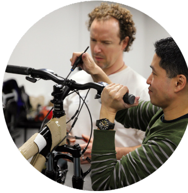
Bike & skateboard builds