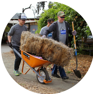
Urban & school gardening