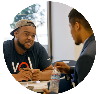
Mock interviews & resume workshops