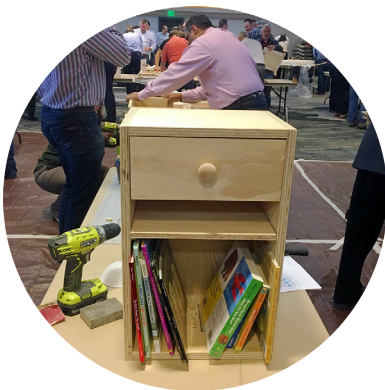
Book cubby builds for kids & families