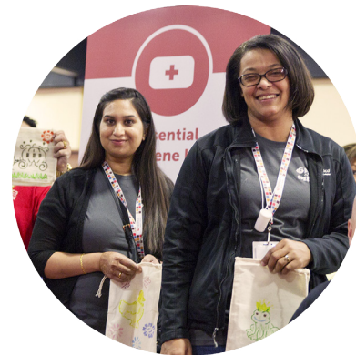
Hygiene kits for homeless individuals