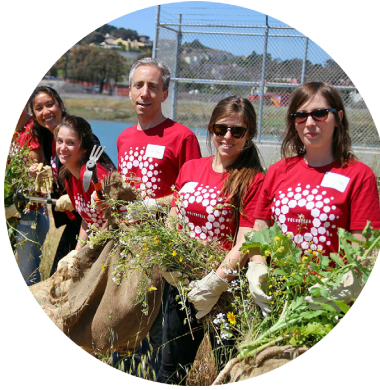
Native habitat restoration