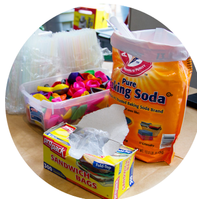
Science kits for kids