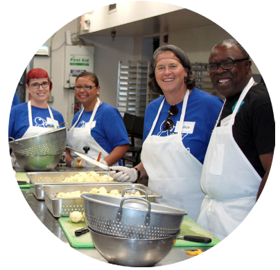
Preparing & serving meals