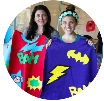
Superhero capas for kids