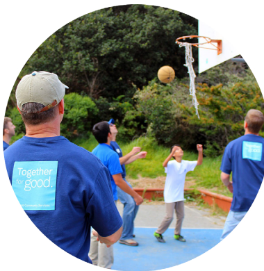
Mentoring & playing with children