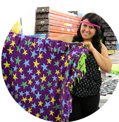
No-sew blankets for people in need