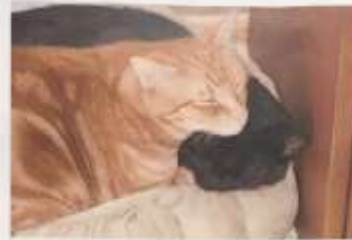
Tank – Male, 13-year old orange/white cat, very affectionate and has a round bullseye on his side