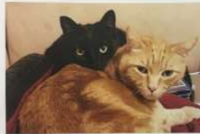
Slick – Female, 13-year old black cat, has a skinny white mark on her chest They have never been apart, and if they're alive, they will want to be together