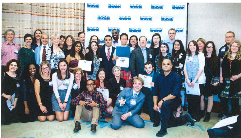
President's Volunteer Service & Boston Cares Service Champion Honorees