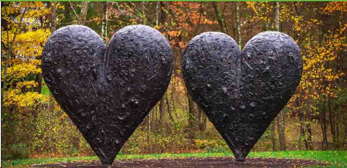
deCordova Hearts