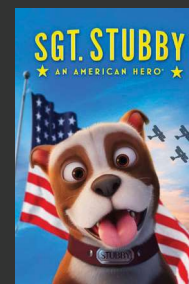
Sgt. Stubby: An American Hero