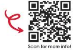
Scan for more info!

Our dogs would love to spend time out of their kennels with you! Volunteer to take an adoptable dog out for a fun outing such as a hike, a coffee date, or a meal at a pet friendly location. Field trips can last from an hour to all day. Whatever works for you, works for us!