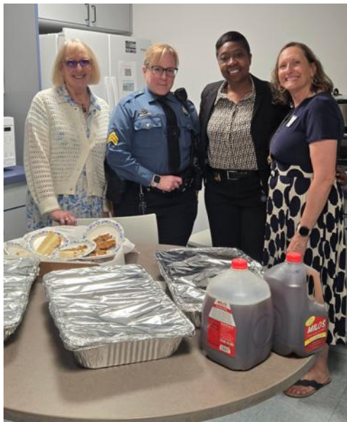
In honor of Police Week the remaining food from the banquet was donated to State Police Troop 5.

Today we honor all you do, With grateful hearts, we celebrate you!